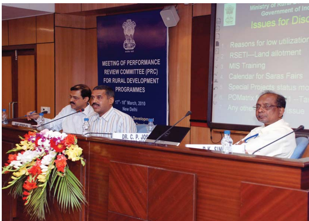
Secretary (RD) on the second day of the PRC

The meeting reviewed the progress of Rural Self Employment Training Institutes (RSETIs). It was pointed out that the process to acquire lands for RSETIs should be expedited. In view of the fact that in some States parent banks were not coming forward for financing under RSETIs, it was suggested that the Ministry of Rural Development would take up the matter with the banks. It was also felt that to enhance sale of SGSY products in North-east States, Saras fairs in Assam and other neighbouring States may be utilized for marketing of SGSY products. Eco tourism can also be developed in states where it is appropriate.