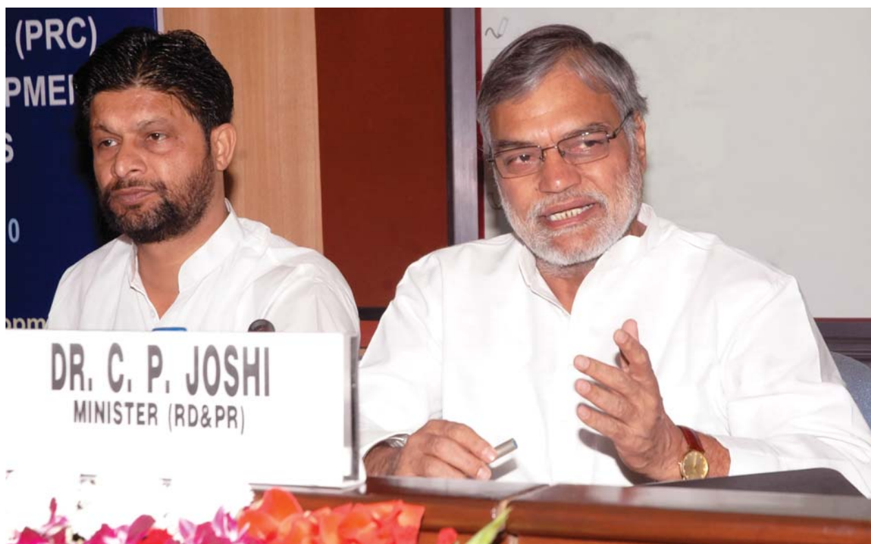
The Rural Development Minister, Dr. C.P Joshi, addressing the Third Meeting of the Performance Review Committee (PRC), in New Delhi

The Performance Review Committee is one of the monitoring tools of the Ministry of Rural Development. The two day meeting was organized in New Delhi by the Department of Rural Development. The programmes of Mahatma Gandhi National Rural Employment Guarantee Act, Swarnjyanti Gram Swarozgar Yojana, Indira Awaas Yojana, Pradhan Mantri Gram Sadak Yojana, Training and BPL Survey were reviewed and discussed.