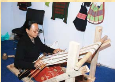
The process of weaving