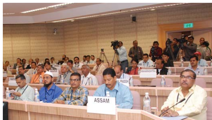
Representatives of various states at the conference

awareness in rural communities on sanitation and good hygiene practices. He urged the delegates to deliberate on developing a comprehensive approach to planning and