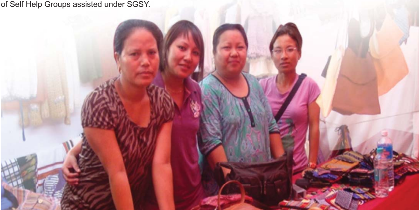
Stall at the SARAS Fair at Margao, Goa

This growing and upcoming SHG is worth recognition and appreciation as it leaves a striking mark in the success stories of Self Help Groups assisted under SGSY.