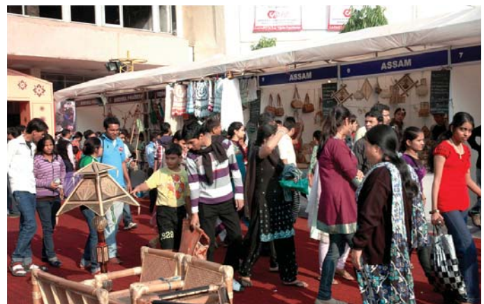
Visitors moving from one stall to another admiring crafts of rural India

displayed in the mela and the visitors purchase directly from the rural artisans. The products have a large popular appeal and people from all across the country participate in the Saras Mela .