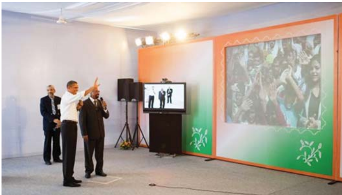
Obama video conferencing with e-panchayat