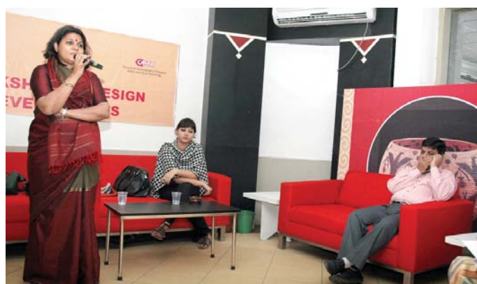
A glimpse of the workshop