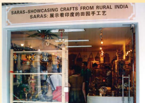
A stall showcasing crafts

able to compete in the market and they derive adequate income to cross the poverty line. The main objective of participation in the expo was to provide SHGs an exposure to international markets and to establish forward and backward linkages.