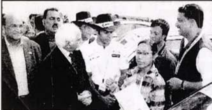
ALL FOR A CAUSE: Vice President Hamid Ansari with MPs Agatha Saranga and Rajiv Pratap Rudy at the car rally in New Delhi on Sunday. A participant (right)