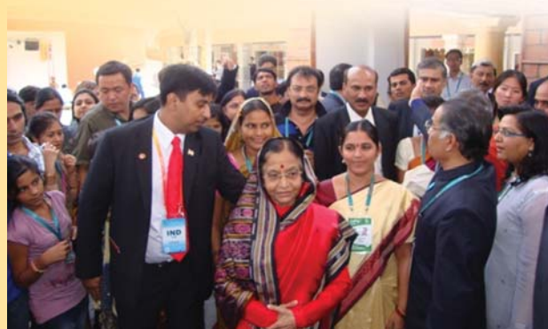
H.E. President of India, Smt. Pratibha Devisingh Patil, with delegates

One of the unique features of the Indian pavillion was its bamboo dome, which was the largest in the world. At the Indian pavillion, there were 14 stalls for display and sale of handlooms and handicrafts.