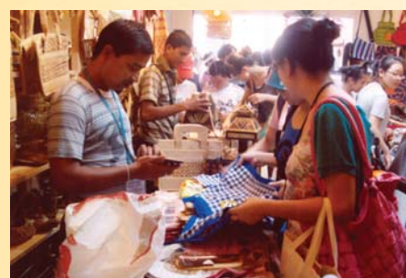
A craftsmen selling his goods

Six states namely Andhra Pradesh, Rajasthan, Jharkhand, Uttarakhand, Kerala and Assam were selected to participate in the expo. The response of the visitors to the stalls of the Ministry was very encouraging. During the Expo, six SHGs sold products worth more than ₹ 20.56 lakhs.