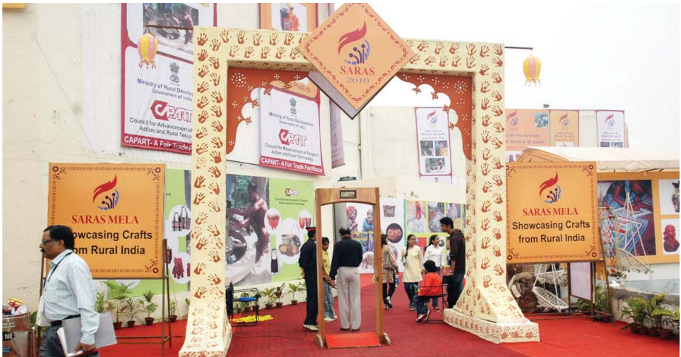
Visitors entering the Saras Mela organized by CAPART and the Ministry of Rural Development