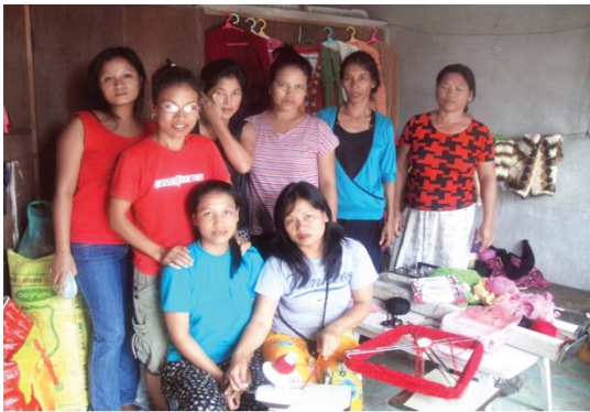
Members of the SHG at their workplace